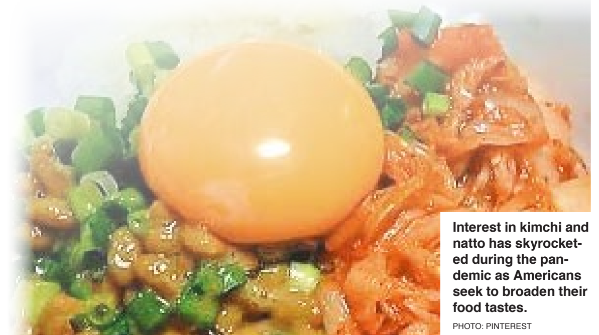
Interest in kimchi and natto has skyrocketed during the pandemic as Americans seek to broaden their food tastes.