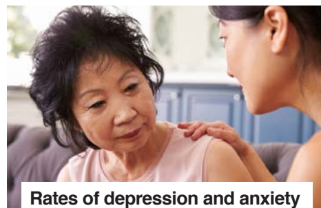
Rates of depression and anxiety have soared as a result of the ongoing pandemic.