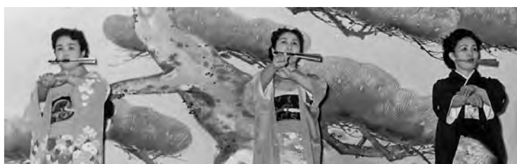
Seabrook Minyo dancers perform "Ume ni mo Haru" at JACL's Chow mein dinner in 1957.