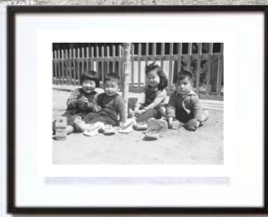
Children sit outside a barrack wearing a traditional form of wood-soled footwear known as geta.

A bride and groom pose for a wedding day photo on July 24, 1944, with friends and family members inside a camp recreation hall.