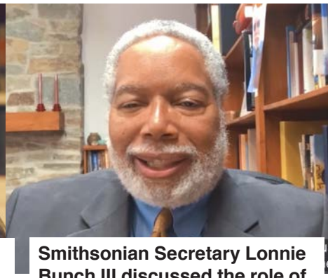
Smithsonian Secretary Lonnie Bunch III discussed the role of museums in racial reckoning.