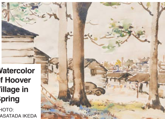
Watercolor of Hoover Village in Spring