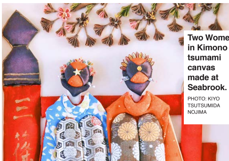
Two Women in Kimono tsumami canvas made at Seabrook.