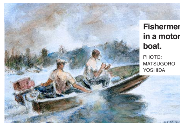
Fishermen in a motor boat.