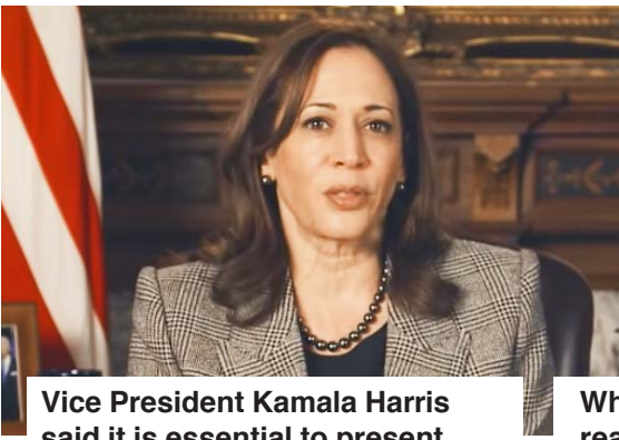
Vice President Kamala Harris said it is essential to present American history accurately.