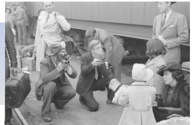
Two young girls being filmed as they wait to board a train that will take them to Owens Valley (Manzanar) from Los Angeles in April 1942.