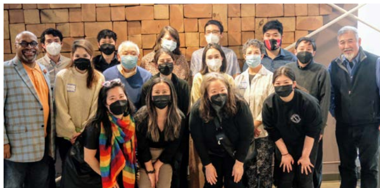
The exhibit "Then They Came for Me" is currently on display at the Jewish Museum Milwaukee.