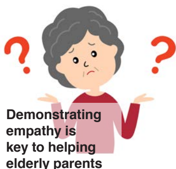
Demonstrating empathy is key to helping elderly parents