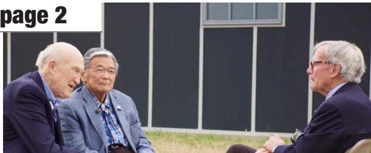
Alan Simpson and Norman Mineta, who developed a lifelong friendship that began while Mineta was forcibly incarcerated in Heart Mountain, Wyo., during WWII, meet with former NBC anchorman Tom Brokaw (right) for an interview for a story that appeared on MSNBC's "Morning Joe" in 2019.

Born on Nov. 12, 1931, Norman Yoshio Mineta was 10 and wearing his Cub Scouts uniform when he and his parents were sent to the Heart Mountain internment camp in