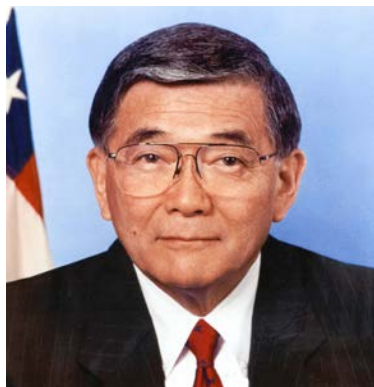
Norman Y. Mineta dedicated his life to public service. He passed at age 90 on May 3.