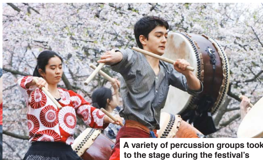
A variety of percussion groups took to the stage during the festival's afternoon lineup. Pictured is the Swarthmore Taiko Ensemble.

The West Powelton Drummers, also known as the "Sixers Stixers" because they frequently perform at Philadelphia 76ers basketball games, were one of the many drumline groups to perform on the festival stage.