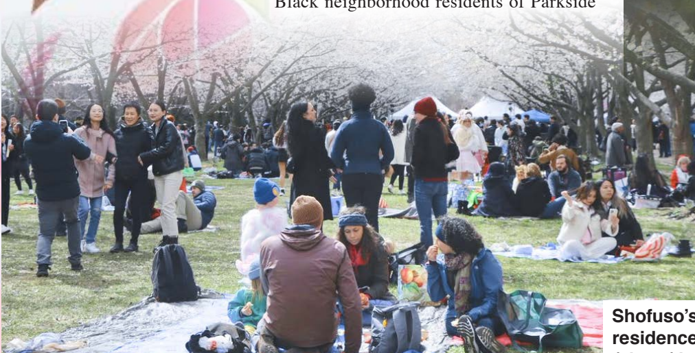
Adhering to traditional ohanami practice, festivalgoers at the Shofuso Cherry Blossom Festival enjoy picnics and music under the beautiful sakura blossoms.