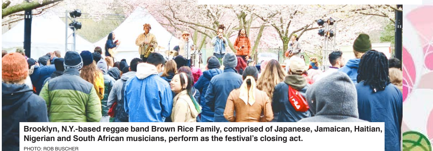
Brooklyn, N.Y.-based reggae band Brown Rice Family, comprised of Japanese, Jamaican, Haitian, Nigerian and South African musicians, perform as the festival's closing act.

SHOFUSO CHERRY BLOSSOM FESTIVAL OF PHILADELPHIA