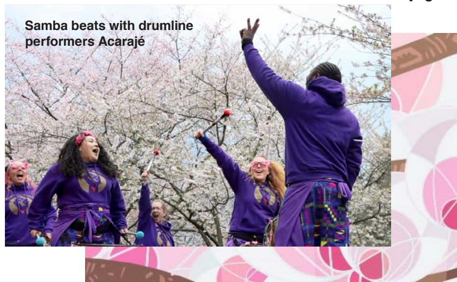
Samba beats with drumline performers Acarajé