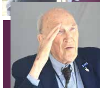
Sen. Alan Simpson salutes the flag as it's being raised by a Powell, Wyo., Boy Scout troop.