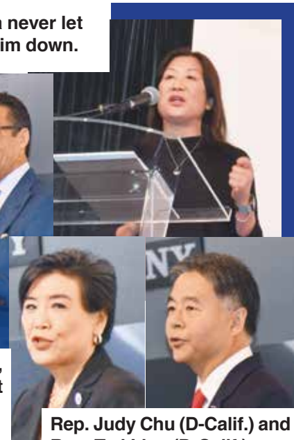
Rep. Judy Chu (D-Calif.) and Rep. Ted Lieu (D-Calif.)