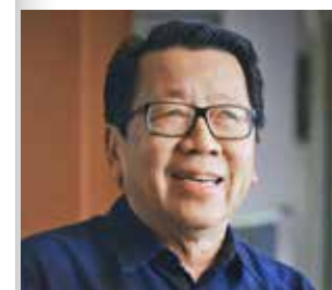
Ben Fong-Torres in Netflix’s “Like a Rolling Stone: The Life and Times of Ben Fong-Torres”