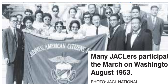
Many JACLers participated in the March on Washington in August 1963.