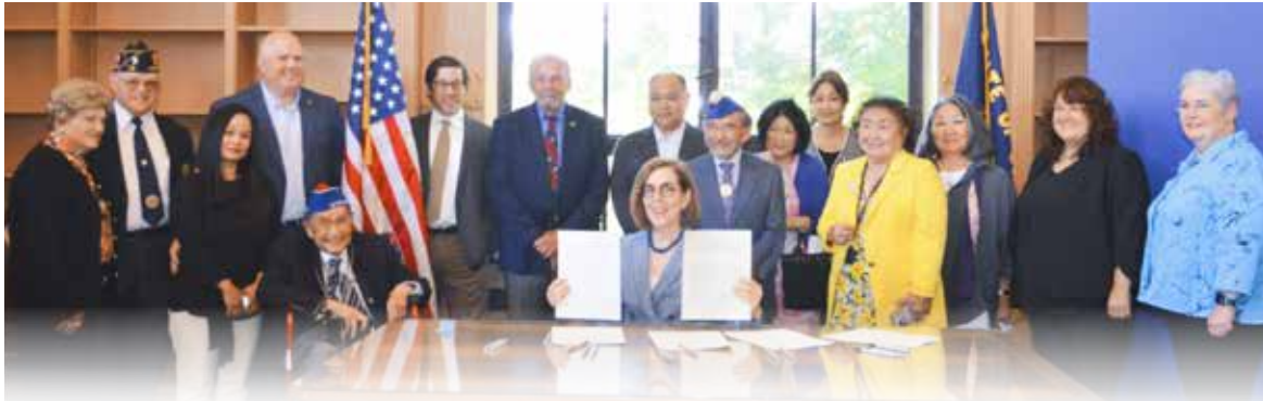
Oregon Gov. Kate Brown (center) signed Senate Bill 1509 on Aug. 5, officially designating State Highway 35 in honor of Nisei veterans who fought in World War II.