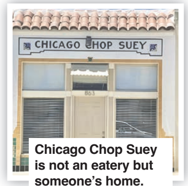
Chicago Chop Suey is not an eatery but someone's home.