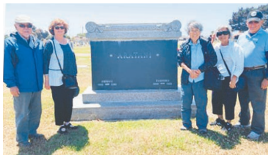
Guadalupe trip participants are pictured at the Aratani family gravesite at the Guadalupe Cemetery.