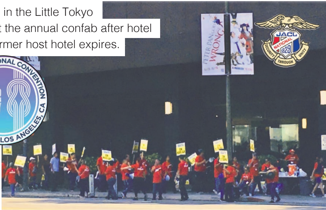
DoubleTree by Hilton Hotel Los Angeles workers on strike in Little Tokyo on July 3