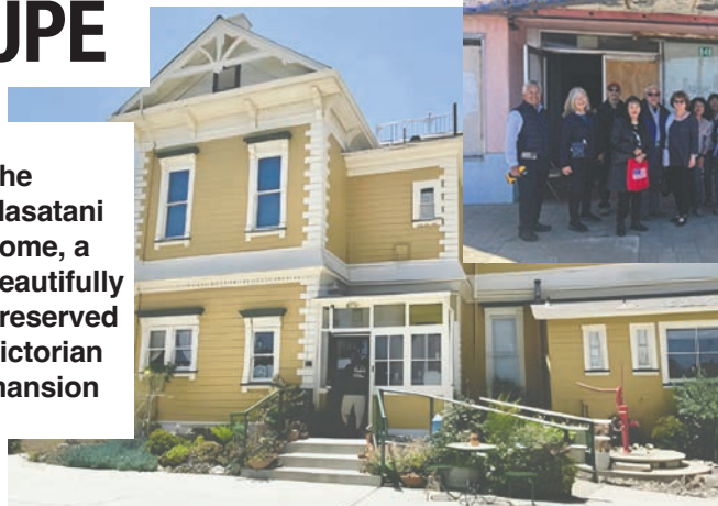
The Masatani home, a beautifully preserved Victorian mansion

The Royal Theater was constructed in 1940, with the building costing roughly $30,000 to build. The theater, which took four months to construct, could seat 530 people; the grand opening occurred on Aug. 30, 1940. In its early years, it hosted films and the-