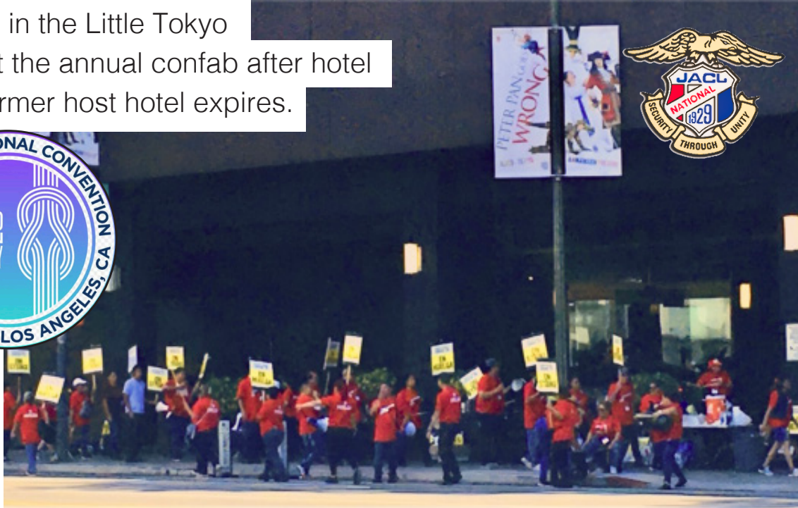
DoubleTree by Hilton Hotel Los Angeles workers on strike in Little Tokyo on July 3