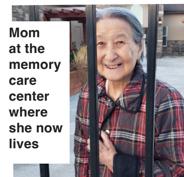
Mom at the memory care center where she now lives