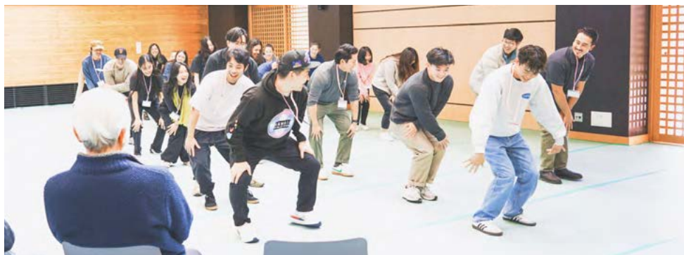
Group C shares some American dances as a thank you to their host families in Suō-Ōshima.