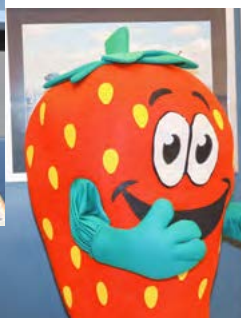
Berry, mascot of the California Strawberry Festival