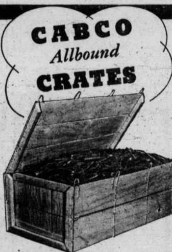
Cabco Size No. 1 an even bushel capacity

In sugar beets, net profits from the use of fertilizers have amounted to as much as $25 per acre, with profits of from $10 to $15 being common.