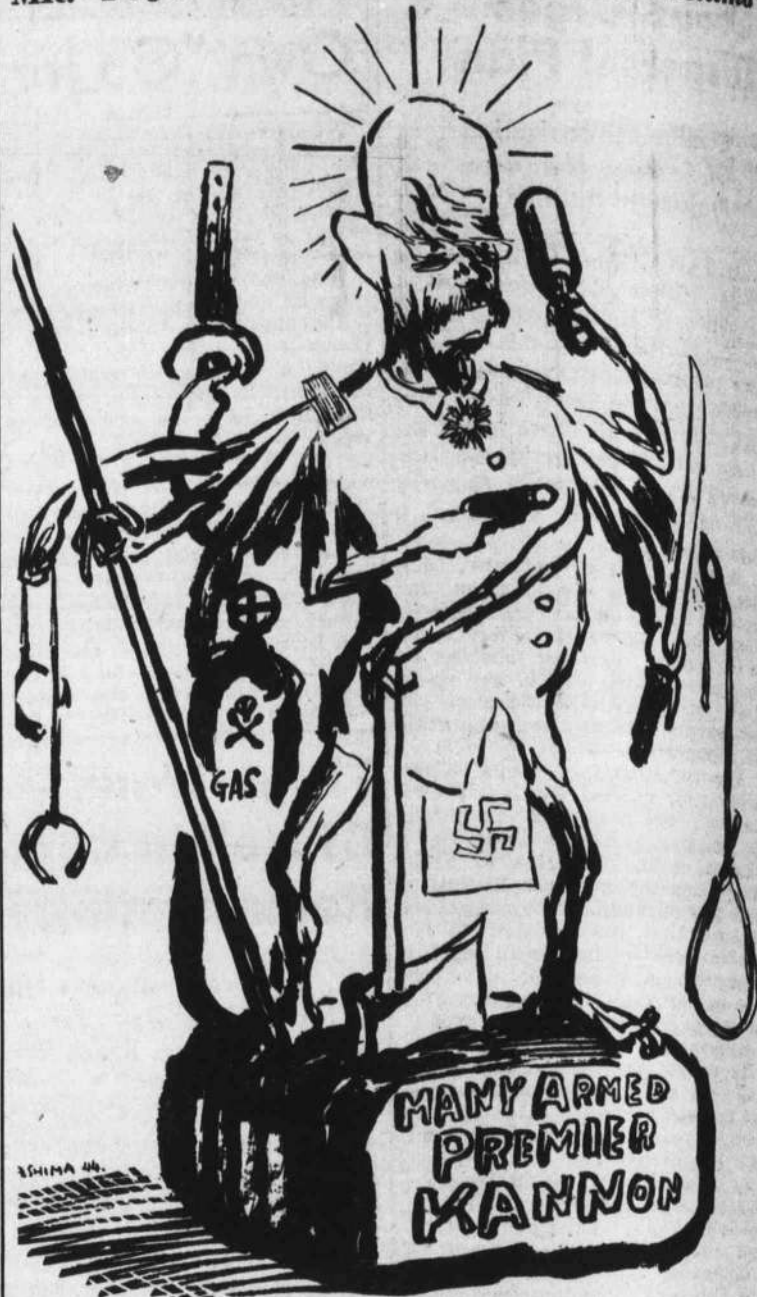
The General Has Many Jobs