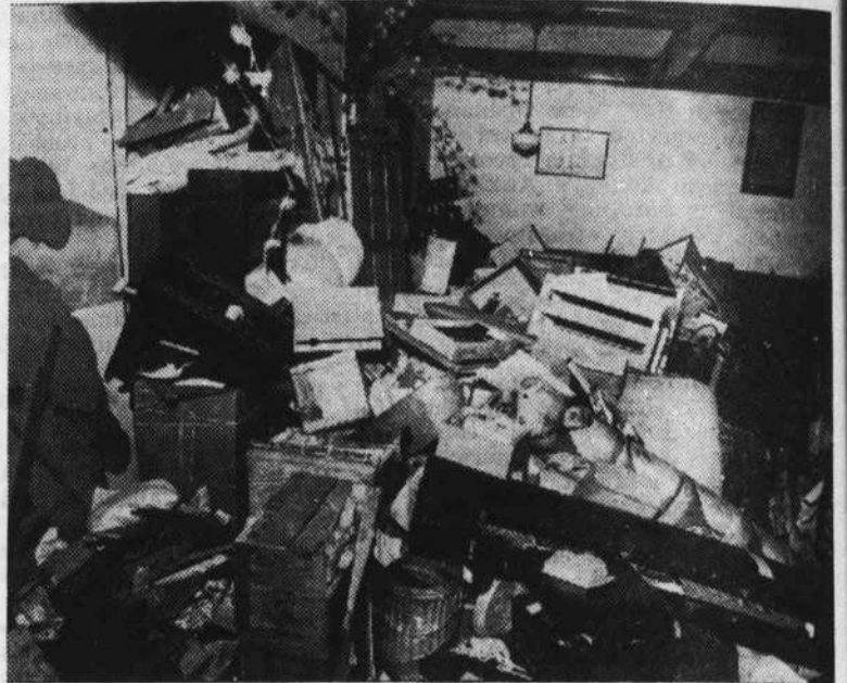
The top photo shows stored goods of evacuees of Japanese ancestry at the government warehouse at 836 Santee St., in Los Angeles. It contrasts with the lower photo which shows a storeroom at the Nichiren Buddhist temple at 2800 East Third St. in Los Angeles after it had been pillaged by vandals. Thieves and vandals have stolen and damaged privately stored property of evacuees in other California and Northwest cities. Evacuee property division of the War Relocation Authority maintains warehouse facilities in major West Coast centers.