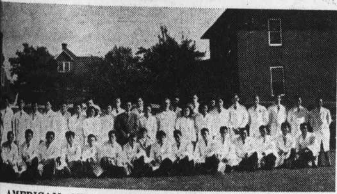
AMERICAN CHICK SEXING ASSOCIATION SCHOOL GRADUATING CLASS, FALL OF 1947