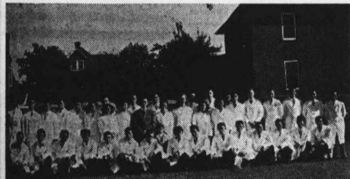
Part of the school-trained American Chick Sexing Ass'n staff.

728 South Hill Street, Los Angeles 14, Calif., U.S.A.