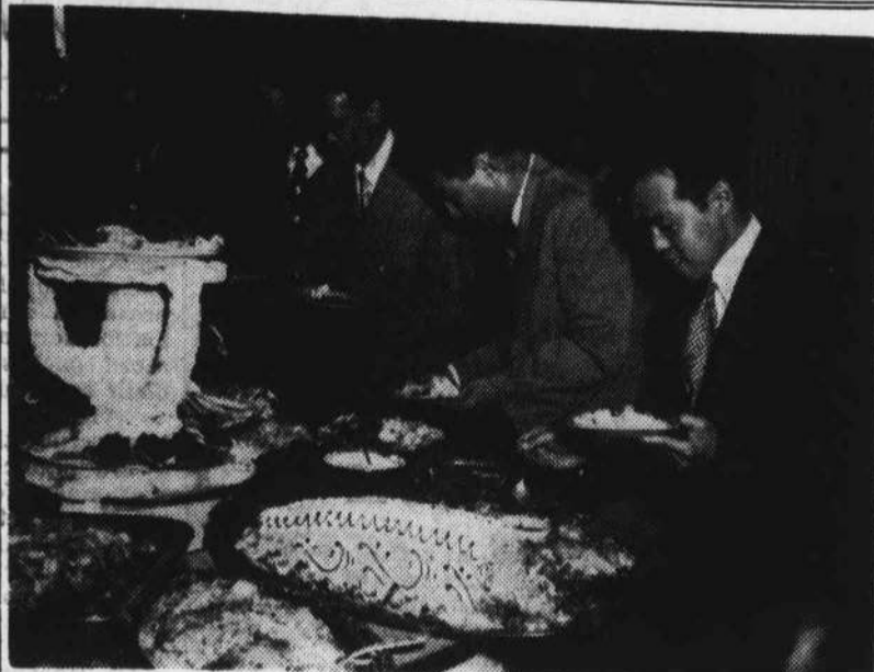
Smorgasbord was a favorite with diners at the banquet held for delegates and boosters at the JACL's Midwest District Council meeting on June 25 in Chicago.