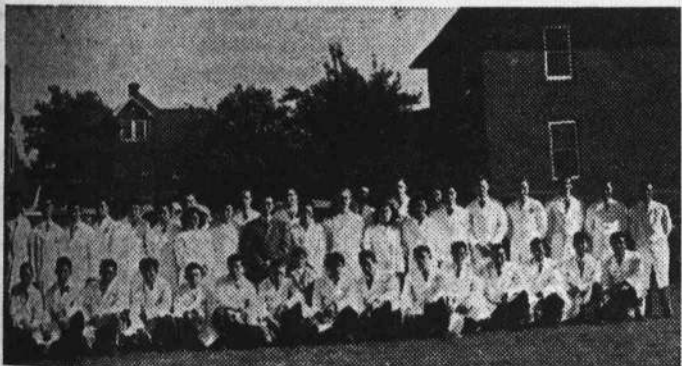
Part of the school-trained American Chick Sexing Ass'n staff.

728 South Hill Street, Los Angeles 14, Calif., U.S.A.