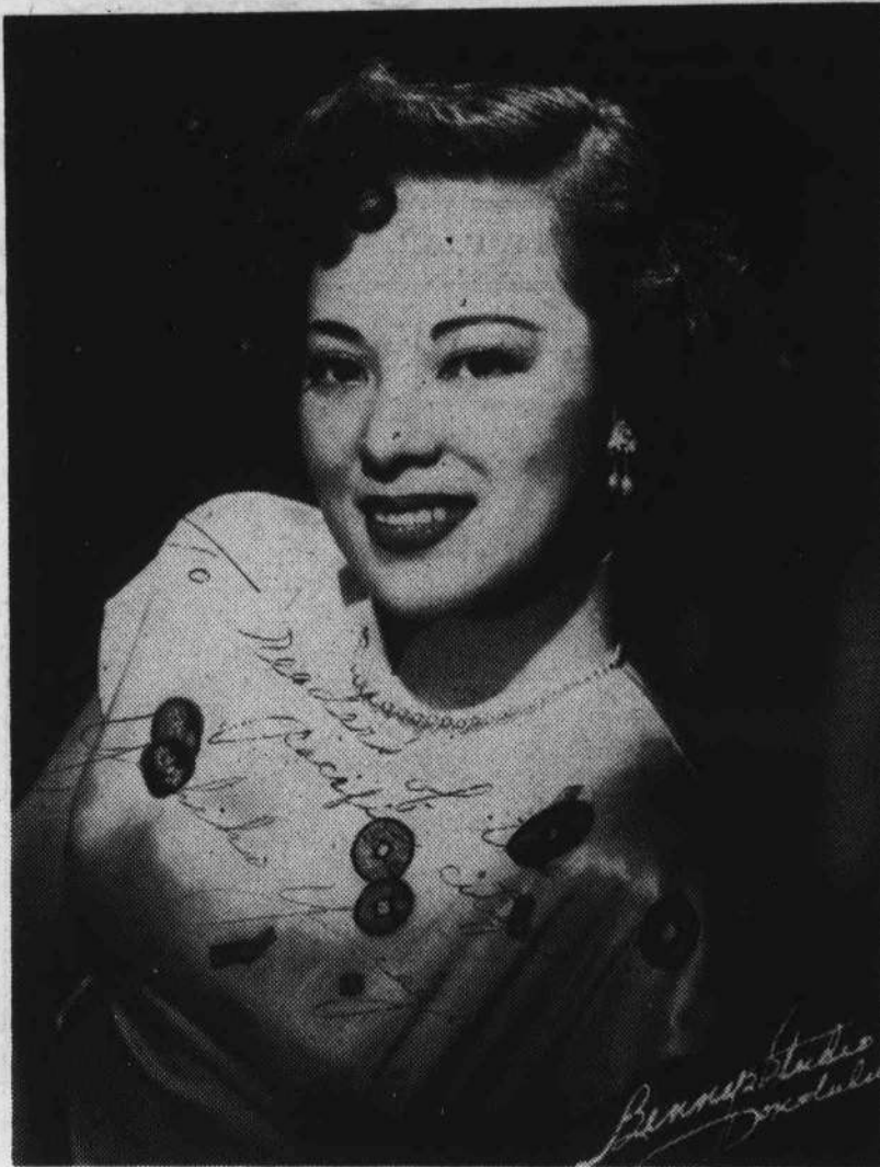
Yoshiko Yamaguchi, Japanese film star who won fame under the name of "Rikoran" in the film "China Night," will visit the United States soon. She will receive a Technicolor film test in Hollywood and will study singing in New York. Miss Yamaguchi, born and raised in Manchuria of Japanese parents, speaks English, French, Russian and Japanese.

He will leave for Japan sometime around June 15.