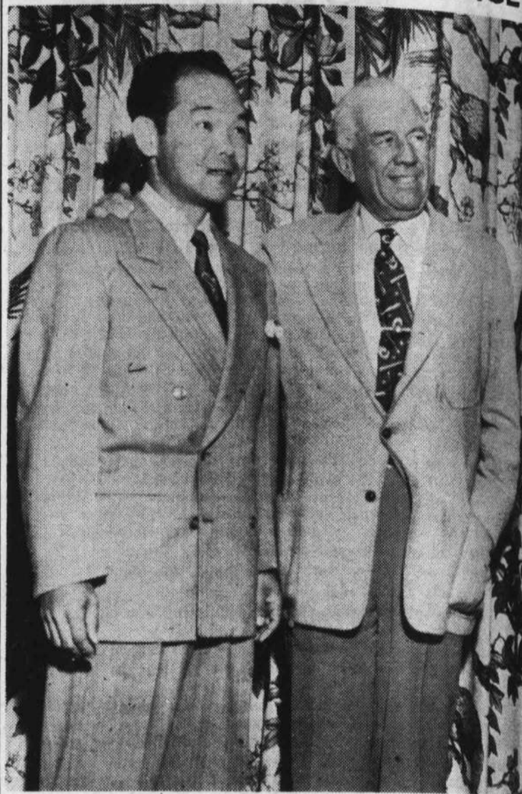
CLEVELAND, O. — Tris Speaker, one of baseball's all-time greats, delighted enthusiastic ball fans at the Cleveland JACL's "Wigwam Night" on May 23 at the Euclid Avenue Congregational church.

Speaker related many of his early experiences as a ball player and told humorous anecdotes from his life in the big leagues.