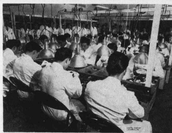
CLASS OF 1949 AND INSTRUCTORS