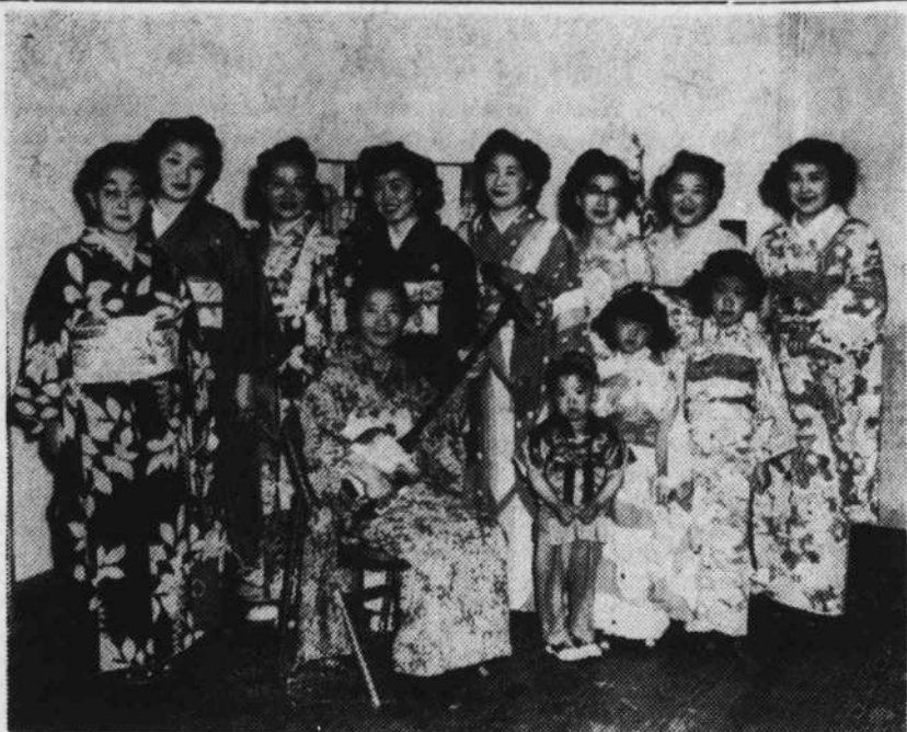
Participants in a recent Japanese festival doll display and program presented by the Carolyn Guild of Idaho Falls included, left to right: