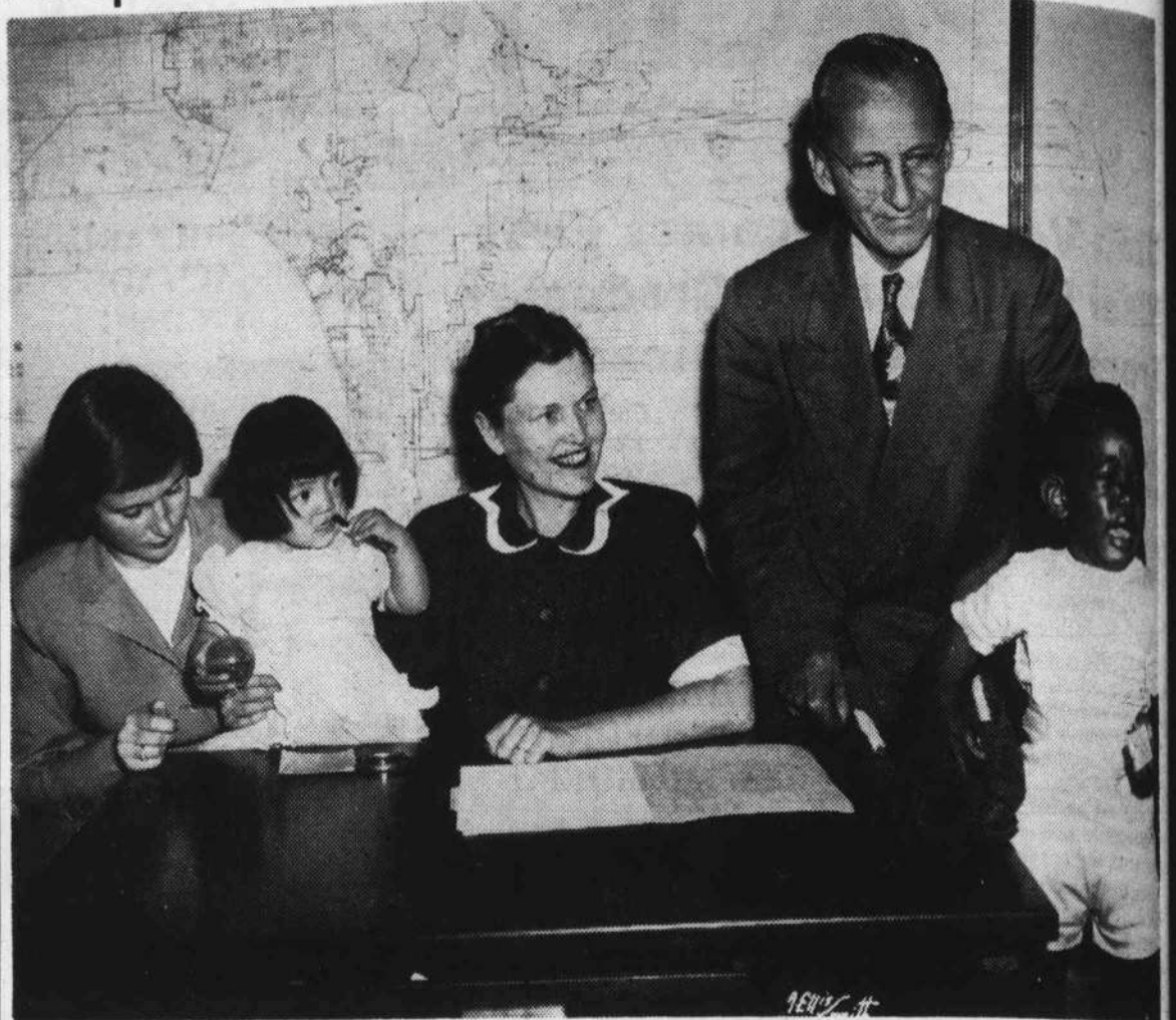
A youngster of Japanese ancestry under care of the Los Angeles County Bureau of Adoptions "helps" staff members with their plans for Open House, to be held June 13 at the bureau's offices at 205 South Broadway.

The other child, in a less cooperative mood,