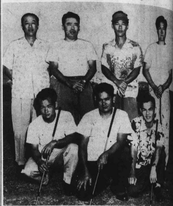
HONOLULU—The Japanese American squad won the annual International Goodwill tournament recently at the Ala Wai course for its second win in the two years of the event which is sponsored by the Hawaii Public Links association.