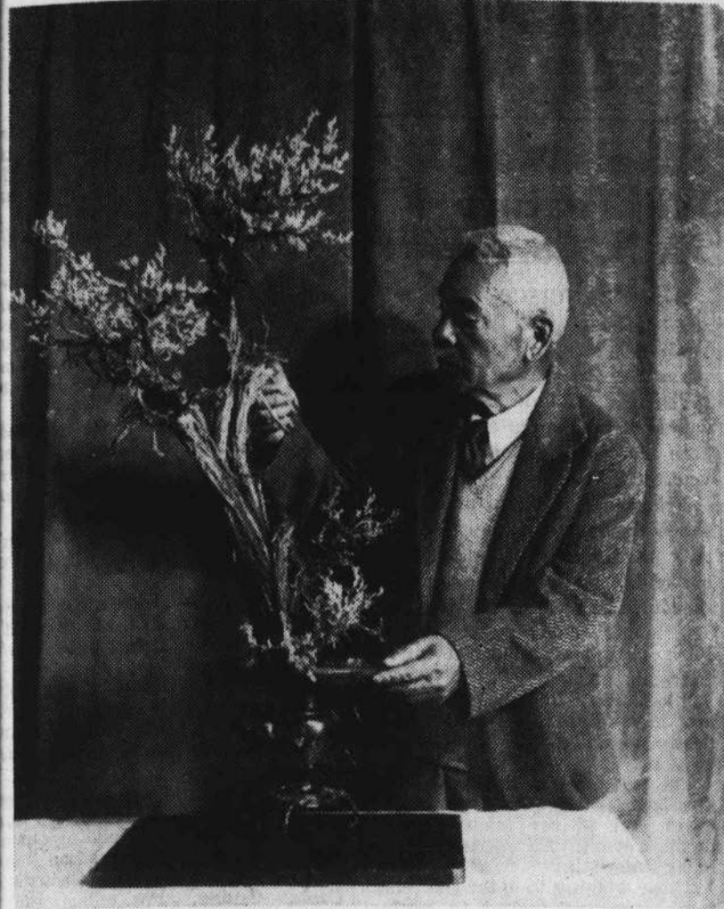
Sagebrush arrangement at Minidoka, Ida.