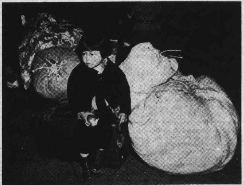
Spring of 1942 on our Pacific Coast.