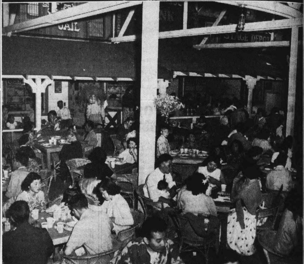
(Top) Here are some of the 1,000 official and booster delegates who registered at the National JACL convention desk at the St. Francis Hotel. (Lower) More than 800 persons attended the convention outing on June 29 at the Pink Horse Ranch near Los Altos. Here are some of the picnickers inside the dining hall at the dinner hour.