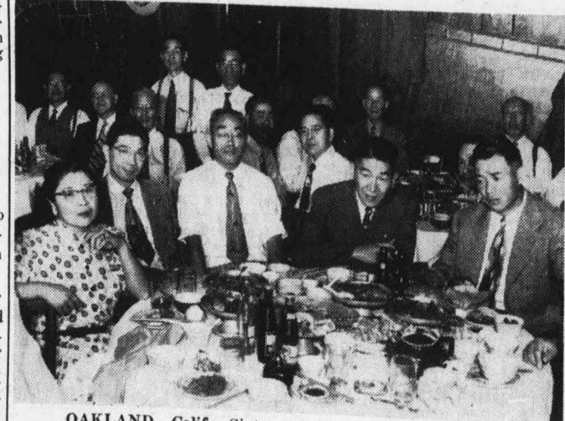
OAKLAND, Calif.—Sixty members and guests attended an appreciation dinner held on Aug. 23 by the East Bay chapter of the JACL in honor of Issei in the community who have contributed time and efforts during the past several years to the JACL ADC.