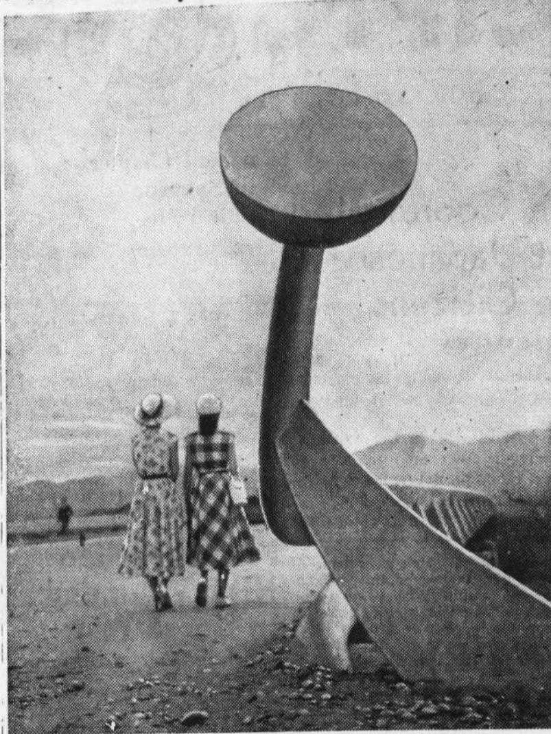
This bridge, designed by Isamu Noguchi, noted Japanese American sculptor, was completed recently in Hiroshima, Japan, where a Noguchi-designed memorial for atom-bomb victims was a subject of controversy. Noguchi, whose studio is in New York, has been residing near Tokyo since his marriage last December to Yoshiko (Shirley) Yamaguchi, star of the recent 20th Century film, "Japanese War Bride."