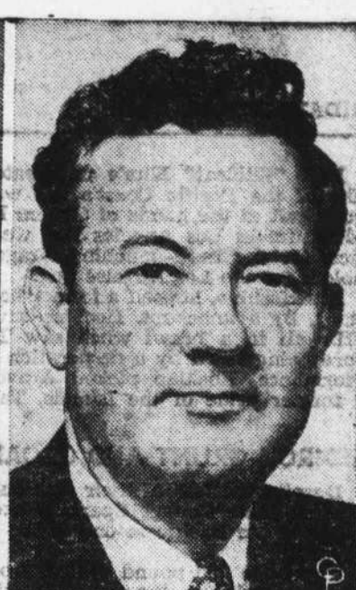
Sen. John Sparkman

his proposal of returning the troops from Japan would cause a tempting objective for Communists to rush into the vacuum creating a most menacing threat, if not actual war itself.