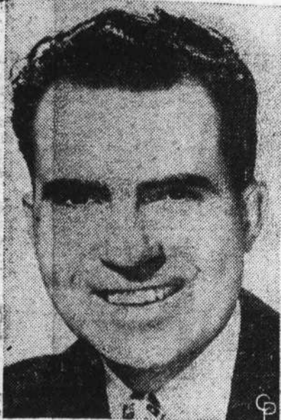
Sen. Richard Nixon