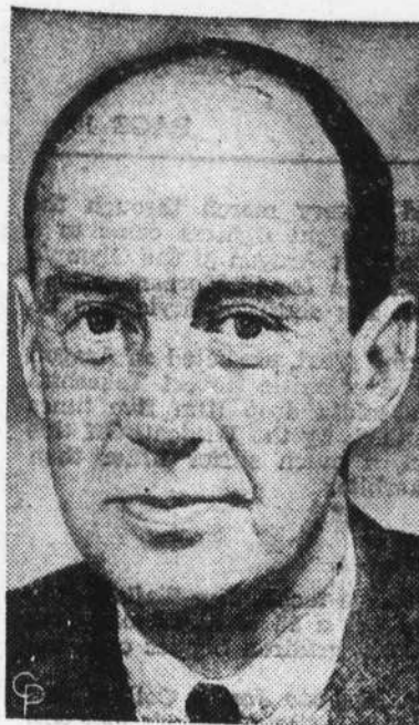
Gov. Adlai Stevenson