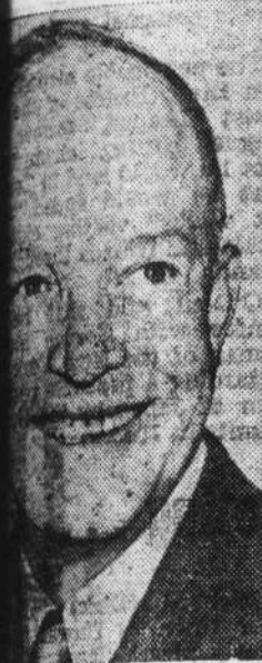
Dwight D. Eisenhower