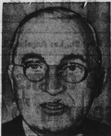
HARRY S. TRUMAN He was, and is a real champion of human rights.

Though he vetoed two major bills (the Walter Resolution in 1950 which would have extended naturalization privileges to the Issei and the Walter-McCarran Act in 1952 which features immigration and naturalization opportunities for Japanese) supported by the JACL, and highly controversial though his administration may have been, there is no question insofar as the JACL and the Japanese American community in the United States are concerned that no president in the history of the republic has contributed more to our general welfare than Harry S. Truman.