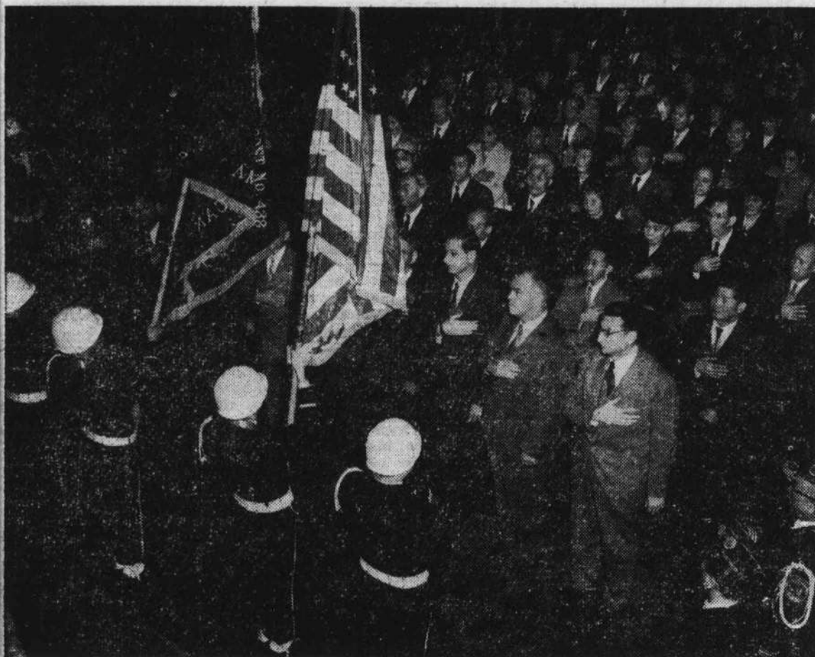
Flag salute opens ceremonies to bestow certificates to some 160 Issei finishing Americanization classes at San Francisco's First Evangelical and Reformed church. Colors were advanced by the color guard of Townsend Harris Post of the American Legion. Classes were conducted in Japanese under auspices of the JACL and Committee on Citizenship for Issei. Certificates were given by the San Francisco public school adult education division.