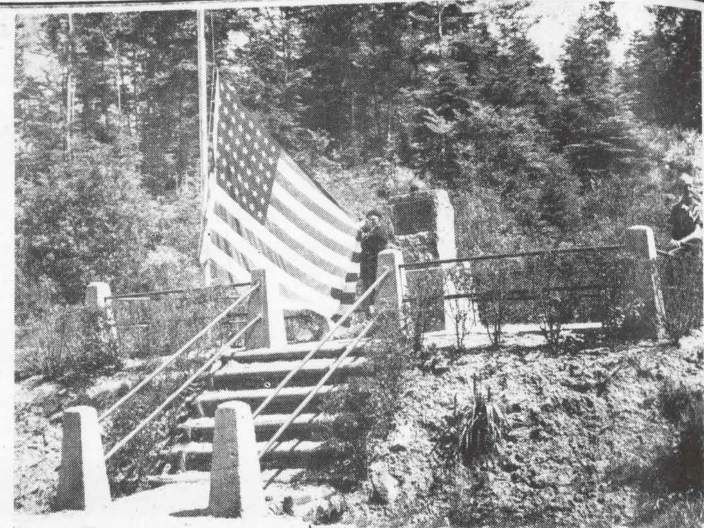
At this hallowed spot in the wooded area of the Vosges mountains near Bruyeres, France, is a memorial park where, each Oct. 30, the historic event of the rescue of the Lost Battalion by the 442nd Regimental Combat Team is commemorated together with the liberation of the

Almost a million home dwellers in suburban Cook County have 25 per cent of the representation they are entitled to,