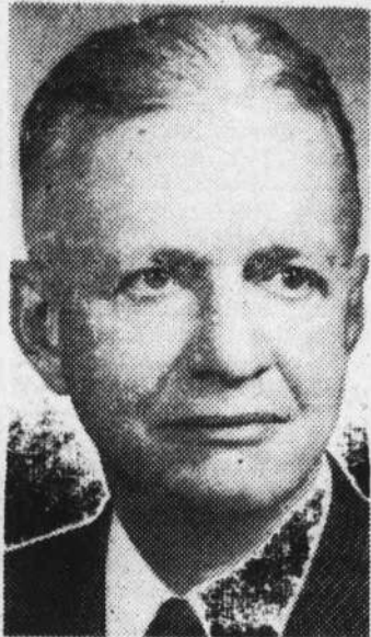
Rep. Francis E. Walter (D., Pa.) will be a guest speaker at the joint EDC-MDC Convention banquet Mar. 26 at the Hotel Washington in the Nation's Capital.

(PLACER) The seventh annual Placer JACL community picnic will be held Sunday, Apr. 17, at the JACL Recreational Grounds. A picnic dance will precede at the Loomis Veterans Memorial Hall, Apr. 16.