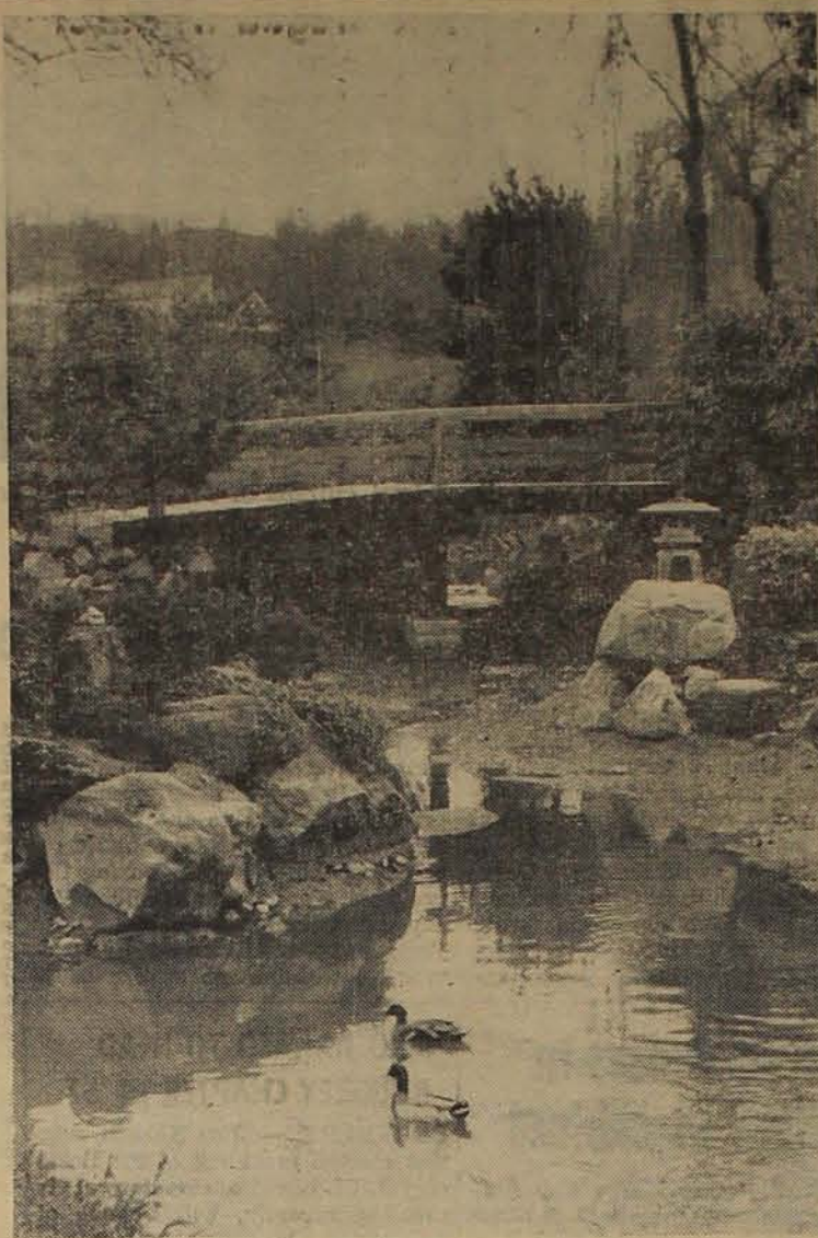
Picturesque scene of Kubota Gardens, regarded as one of the beauty spots of Seattle, features a stone lantern, wooden bridge, weeping willow, Japanese pine and bamboo trees.