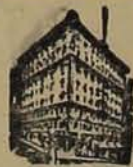
Downtown San Francisco Corner Bush and Stockton