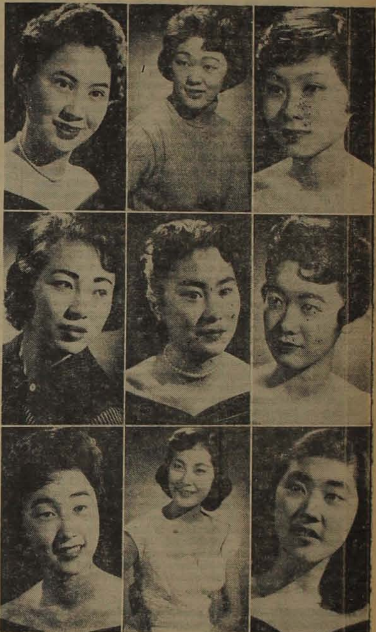
One of these nine girls will be selected as Miss Salt Lake JACL at the Queen's Dance tomorrow night at Memory Park Memorial Hall. As Miss Salt Lake, she will vie with other chapter candidates in the final selection of "Miss JACL 1958" at the Intermountain District Council finals April 8. Brief sketch, in same position as above, follows.

As the first Auxiliary project of the year, the ladies made sushi and visited aged "shut-ins" at local rest homes.