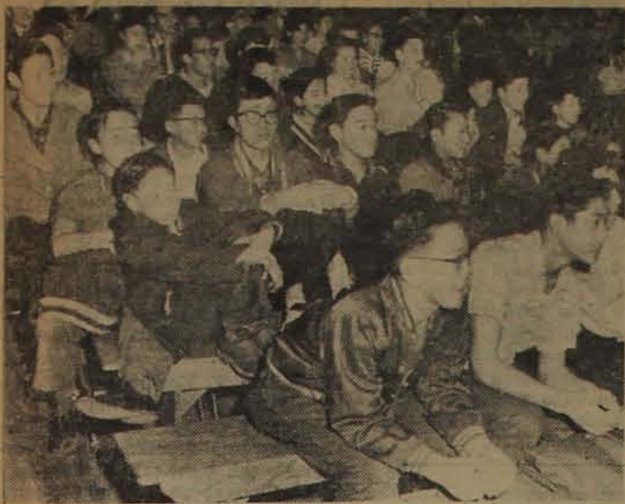
Youngsters view "Go For Broke!" at Seattle Vets Hall.