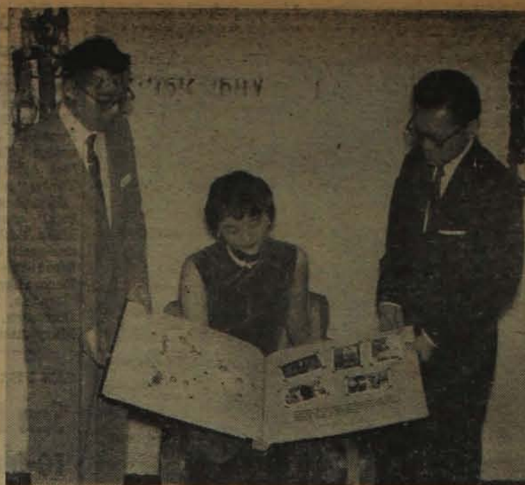
1957 CHAPTER SCRAPBOOK