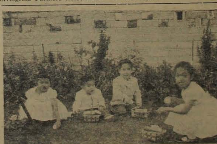
Four Southwest L.A. JACLers-to-be make believe the chapter's Easter Egg Hunt this Sunday at Rancho Cienega, but praying at