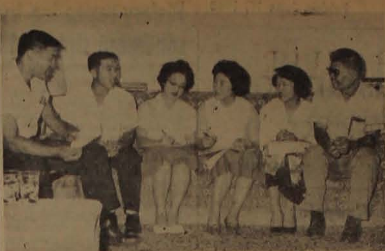
Mt. Olympus Jr. JACLers organize. President at left.