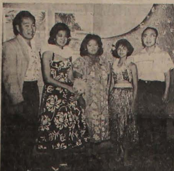
STOCKTON JACL'S TRIBUTE TO HAWAII

POPULATION IN JAPAN STILL RISING: 93 MILLION TOKYO — Japan had 93,418,561 persons on Oct. 1, 1960, according to census statistics released last week. The figure represented an increase of 4.8 per cent over the 1955 national census. Statistics revealed a substantial increase in the urban population.