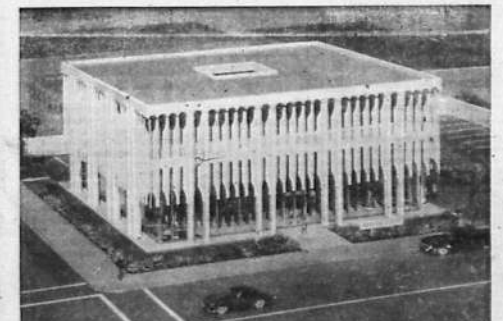
NEW QUARTERS—The San Jose branch of the Dept. of Three of California moves into its new quarters at the corner of N. First and Younger Sts. on Monday.

SATO INS. COY. 346 E. 3rd St. MA 9-1415, AN 1-8515