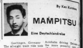
MAMITSU Eine Deutschlandreise