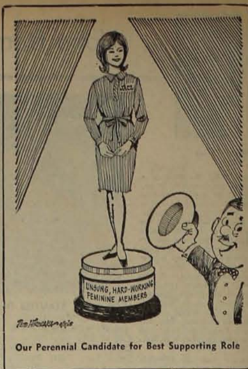
Our Perennial Candidate for Best Supporting Role

By-Laws, 2/3 vote of Chapters: Article VI Duties of National Officers, Article X Budget and Finance.