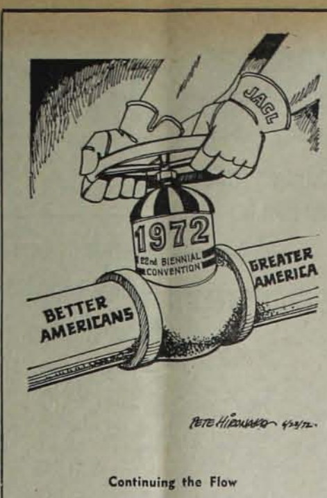
Continuing the Flow