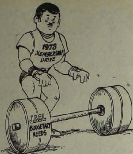
Another All-out Effort Needed

It would be nice of we could somehow achieve something like Pareto Optimality in the economic sense whereby everyone gains and no one loses. But no one seems to have come up with any fool-proof system as yet. It's not necessarily hopeless, and the solution probably lies in everyone giving up a little bit of what they now have or would like to have. Give a little, get a little. But if anyone were to promise "The Solution", I'd say that he was either a fool or a knave.