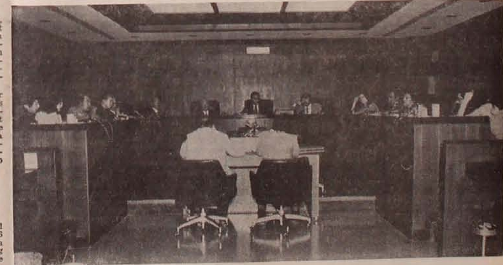
MANZANAR PLAQUE—Scene of the top-level meeting at Sacramento state capitol to approve the text of the Manzanar Camp plaque was attended by National JACL and Manzanar Committee members, and staff representatives of Sen. Dymally, Sen. Dills and Assemblyman Moretti.

He also urged the commission Mar. 20 to hire 13 emergency Employment Act policemen to city-funded positions.