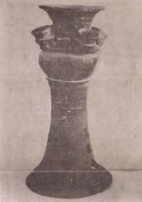
Pottery, Kofun Period (6th-8th Century), Sue-ware