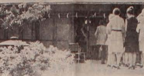
IKEBANA HOUSE—At the Huntington Library in San Marino, Calif., a new Ikebana House was dedicated Sept. 30 at its Japanese gardens. A gift from the Board of Overseers and the San Marino League, the house will be used for flower arranging classes and as an orientation classroom for thousands of school children who tour the garden each year.