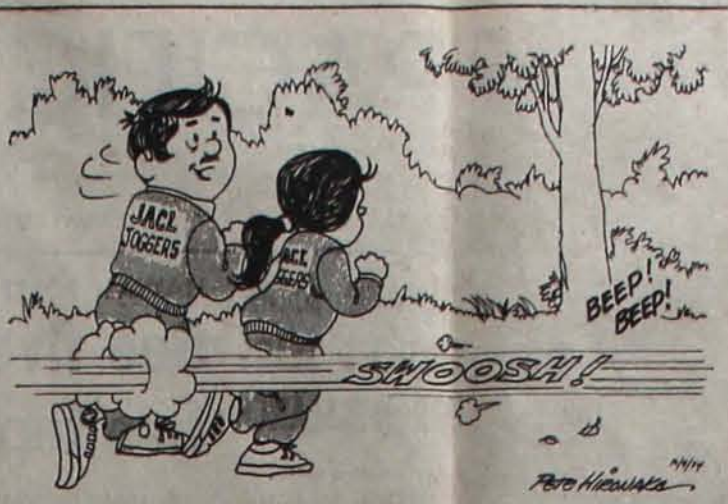
That was either 'The Road-Runner' or a JAY member