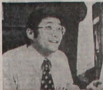
NORMAN Y. MINETA Mayor City of San Jose, California