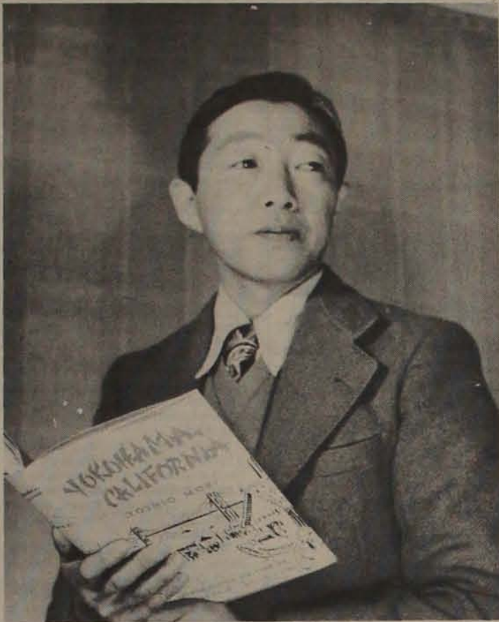
Toshio Mori (1949)