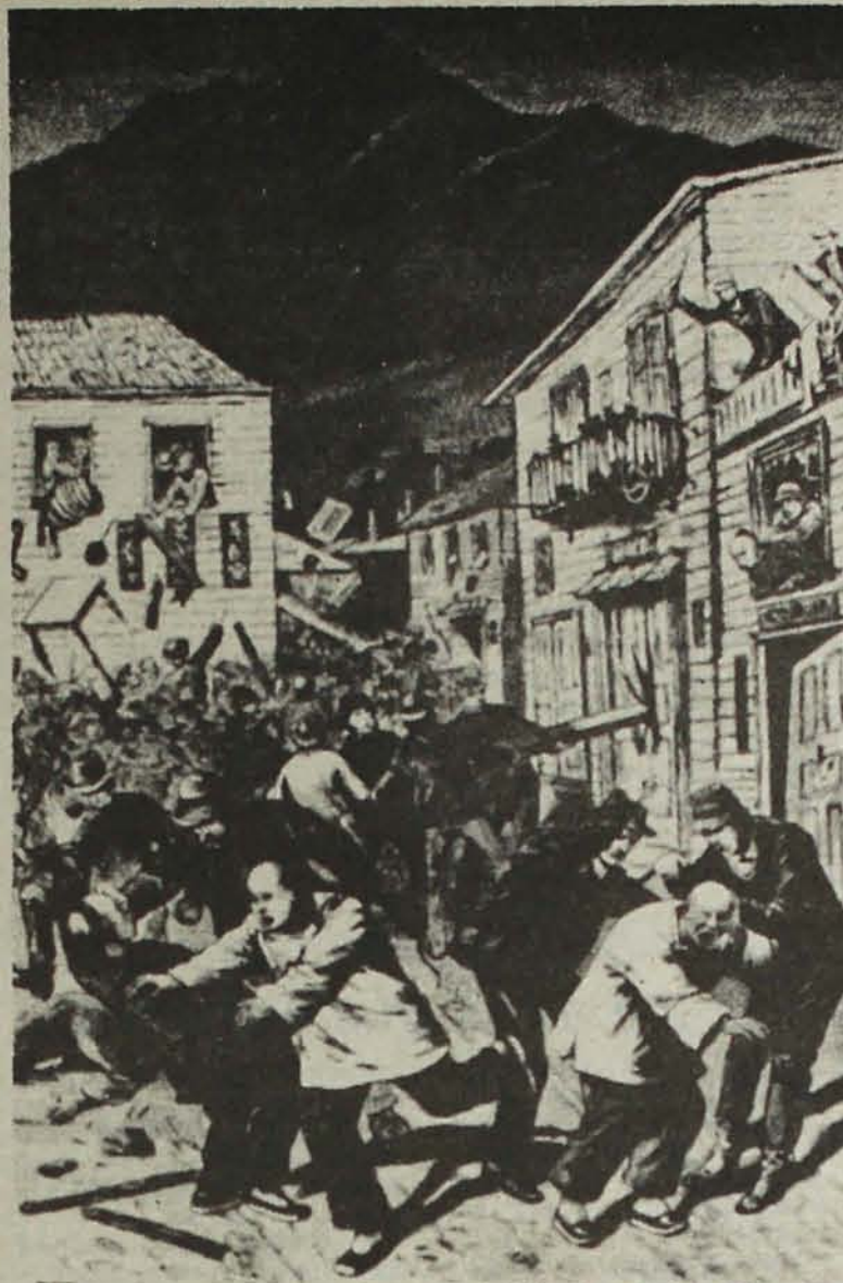
A representation of an anti-Chinese riot in Denver, courtesy of the Library of Congress, is one illustration in Milton Meltzer's "The Chinese Americans."

Little opposition was voiced to Congress' passage of the Act of 1882, which barred the