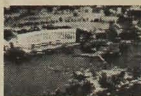
HILO HAWAIIAN Hilo, Hawaii—From $54