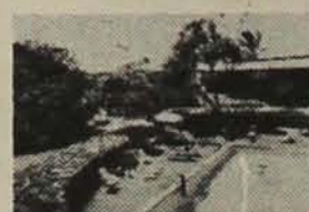
MAUI PALM 5 Kahului, Maui—From $40