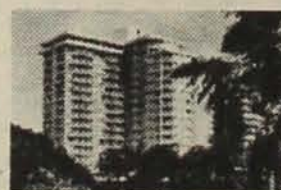
QUEEN KAPIOLANI Waikiki—From $60