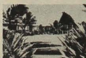
MAUI BEACH Kahului, Maui—From $49