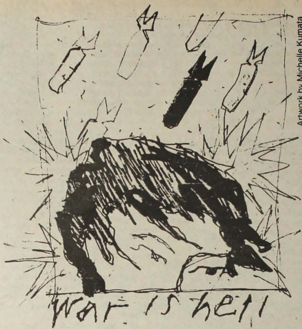
Artwork by Michelle Kumata

It was an arduous journey of nearly 300 miles across the Gulf of Thailand. When they finally reached Thailand, they found no welcoming committee. Instead they were refused permission to dock. So they continued south. They finally reached Songkhla, Thailand (near the Malaysian border), just as their boat broke apart and sank.