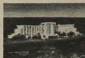
KONA LAGOON Keauhou, Kona—From $59

As low as per day... $40 for two people. Cars provided by National Car Rental