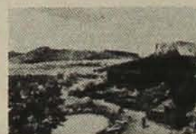
KAUAI RESORT Kauai—From $64