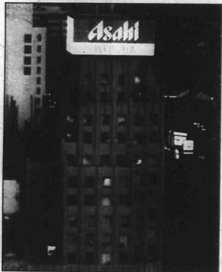
Asahi Breweries, Ltd. has added to the art deco look of Los Angeles with its new four-sided, 4,800 sq. ft. sign 200 feet atop a building in the Miracle Mile area of the city. The sign features two miles of neon and advertises the company's beer.