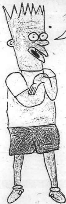
KID'S HERO —Los Angeles student drew this likeness of TV cartoon character Bart Simpson urging everyone to buy American products.

"If they're going to be competing in a world where there's tough competition, they are going to have to become the best and the brightest to compete in that world. When you lose, you just figure out what you did wrong and you do it better. You don't call people names."