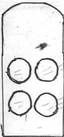
KID ART—Examples from a Los Angeles area school project asking children to write on a "Buy America" theme.