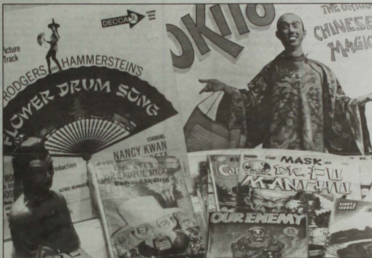
REMEMBER THESE?—Stereotypical images collected for "Out of Focus: Media Stereotypes of Asian Pacific Americans" exhibit are on display through May 12 at Seattle's Wing Luke Asian Museum, 407 7th Avenue South.